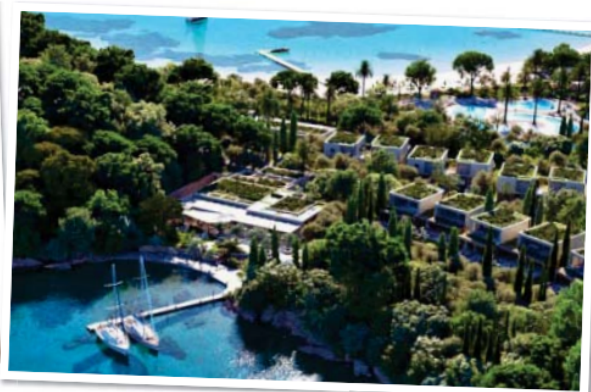
CLASS ACT: The Bellustar, left, has floor-to-ceiling views across Tokyo and, right, The Ikos Odisia in Corfu has 10 pools and the Med to choose from. Above: A computer image of sister hotel Ikos Porto Petro in Majorca, due to open in June