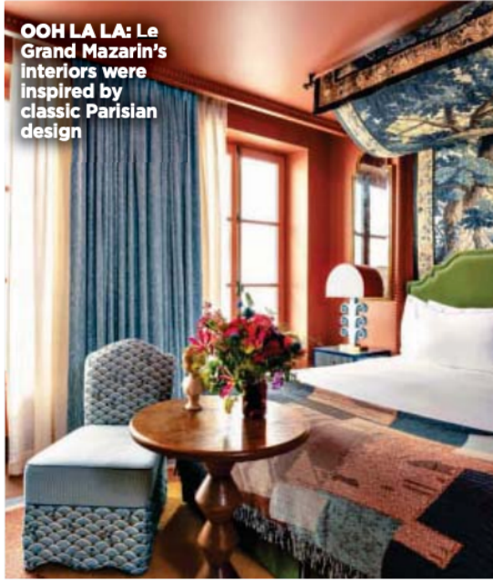
OOH LA LA: Le Grand Mazarin's interiors were inspired by classic Parisian design