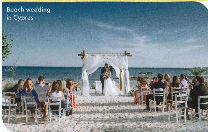
Beach wedding in Cyprus

Luxury French hotel company Airelles will open five-star property Mademoiselle Val d'Isère on December 19 in time for the ski season. The property will be the only luxury hotel in the centre of Val d'Isère to offer ski-in ski-out access. Room rates start from €850 for B&B. valdisere.airelles.com