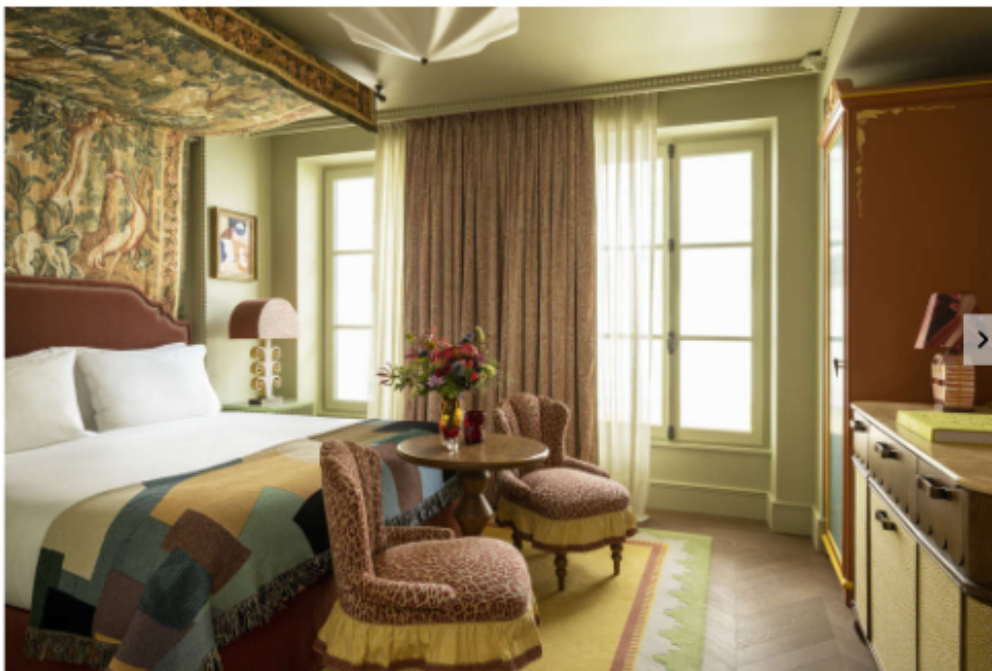
Le Grand Mazarin