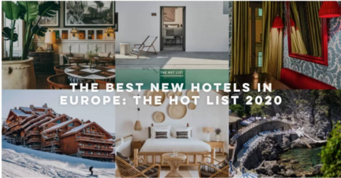
The best new hotels in Europe, as picked by the editors of Condé Nast Traveller for The Hot List 2020

S plashy new stays in our favourite European cities ; fresh beachy boltholes on the French Riviera and in less-visited pockets of Greece ; a reimagining of a Zurich lakeside classic; and a game-changing Scandi wellness retreat lauded as the biggest opening of the year – these are our favourite new hotels in Europe right now.