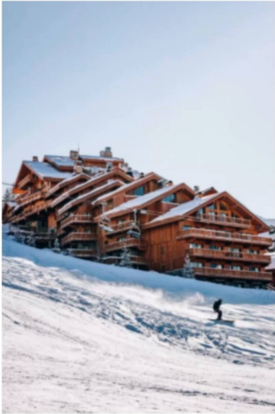
HOTEL LE COUCOU, MERIBEL